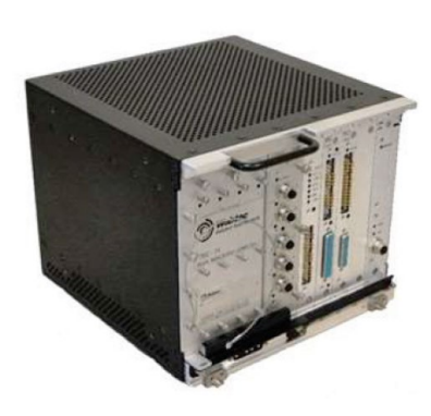
Train Management Computer

Potential to drive additional efficiencies to increase capacity, optimize service and reduce fuel use and emissions.